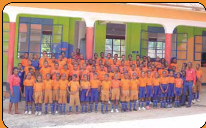
P4 CLASS 2022