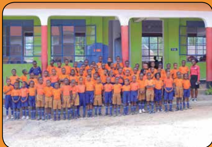
P2 CLASS 2022