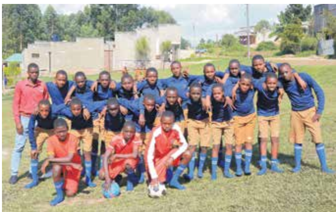
SPORTS CLUB BOYS