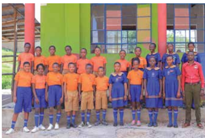
PREFECTORIAL BODY WITH THE PATRON