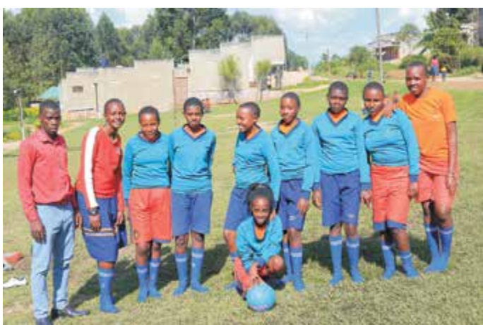
SPORTS CLUB GIRLS