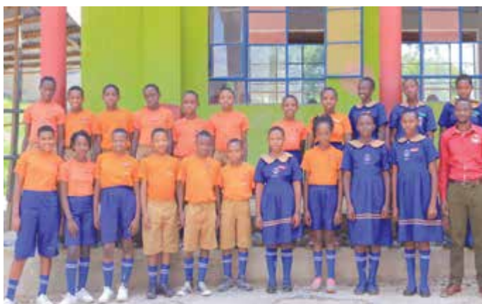
SPORTS CLUB BOYS