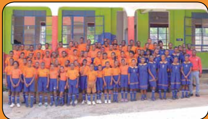
P6 CLASS 2022