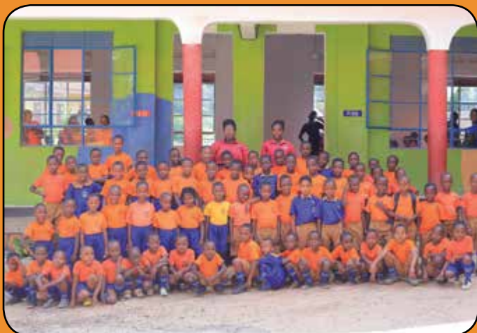
P1 CLASS 2022