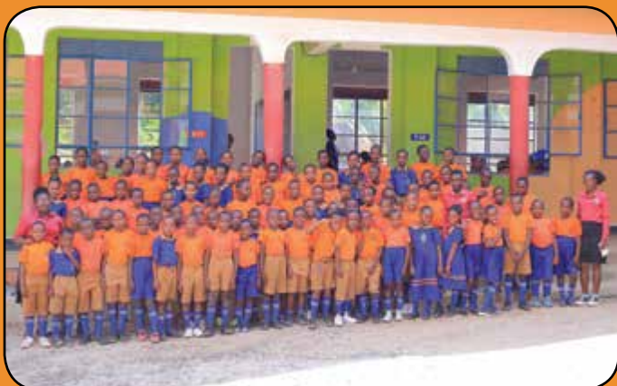
P3 CLASS 2022