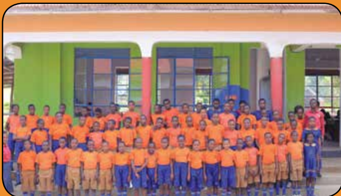
P5 CLASS 2022