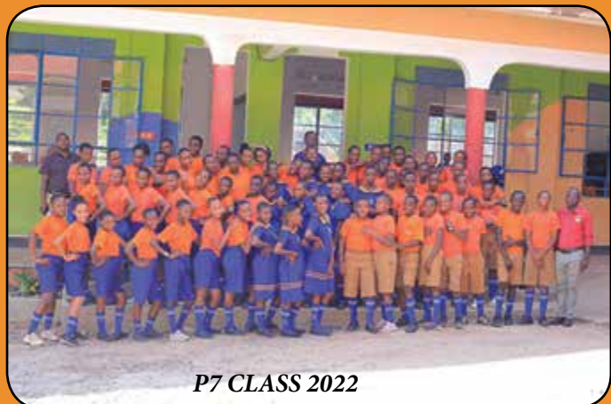
P7 CLASS 2022