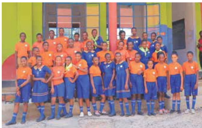
SWAS CLUB AT LAPS