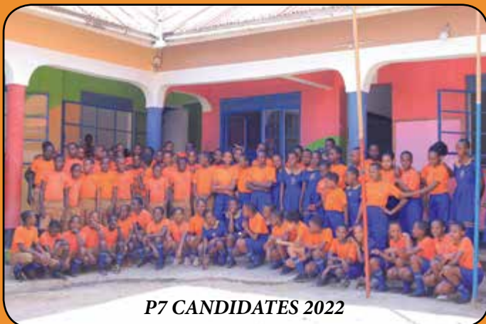
P7 CANDIDATES 2022