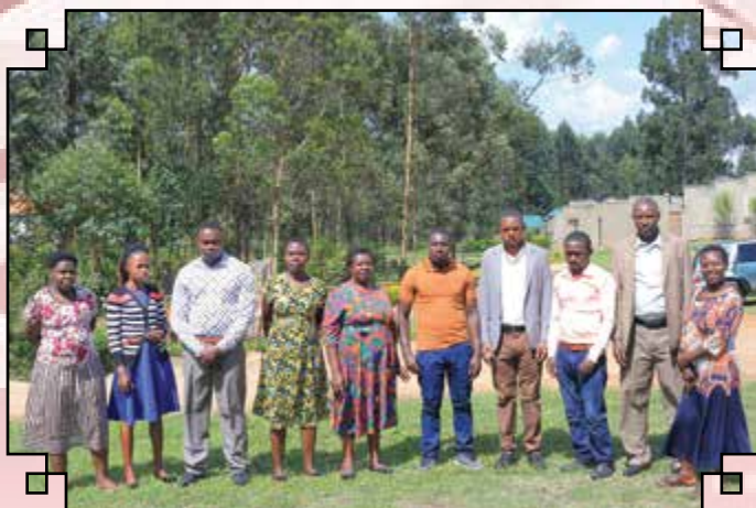
The Non-Teaching Staff