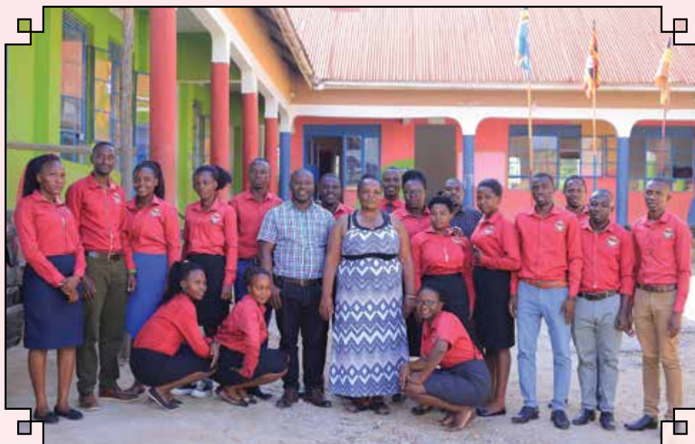
Teaching Staff With The Directors