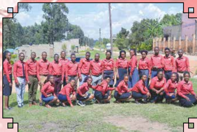
The Teaching Staff