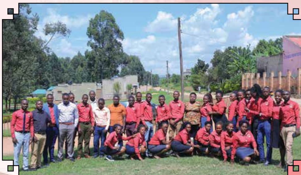
Teaching & Non-Teaching Staff