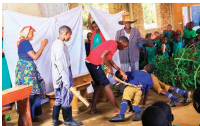
MDD AT LAPS